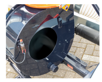
Easy access to the impeller for cleaning.