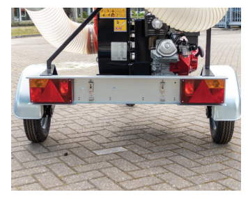
Street lights and number plate holder.