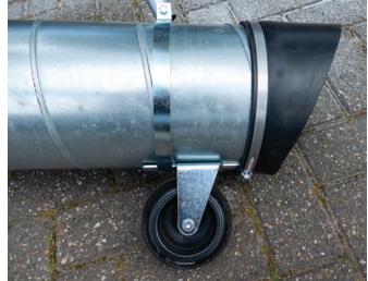
Castor wheel supports the weight wile operating the suction hose.