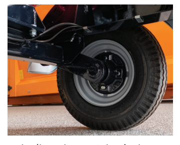
80 km/h road prove Galvanized Torque shaft suspension.