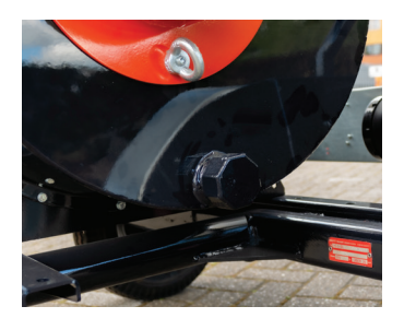
Easy to clean with a garden hose excess Water is drained by plug.