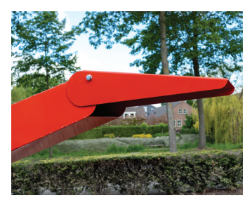
Adjustable end flap.