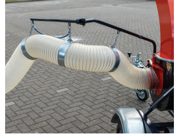
The suction hose with a 5 m radius is supported by a pivoting boom.