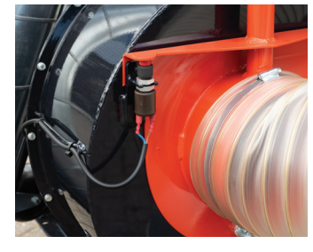
Safety sensor on fan housing shuts of engine during maintenance work.